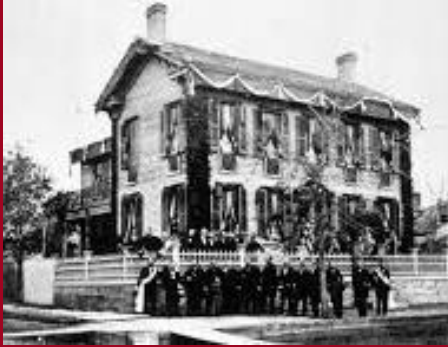
Lincoln's draped home in Springfield